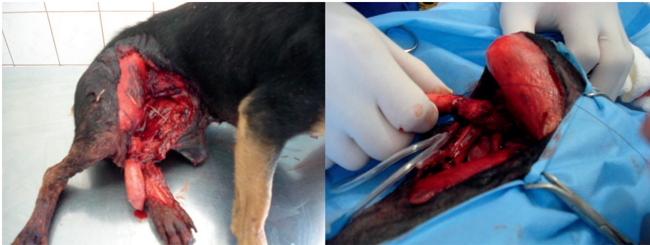
Figure 1. Prepuce and inguinal avulsion, penis exposed and lacerated and tarsal joint mayor trauma. Avulsión prepucial e inguinal, exposición peneana y laceración traumática grave de la articulación del tarso.

iliac and genicular arteries for repair and reconstruction of total avulsion foreskin and inguinal region skin preserving the penile structures.