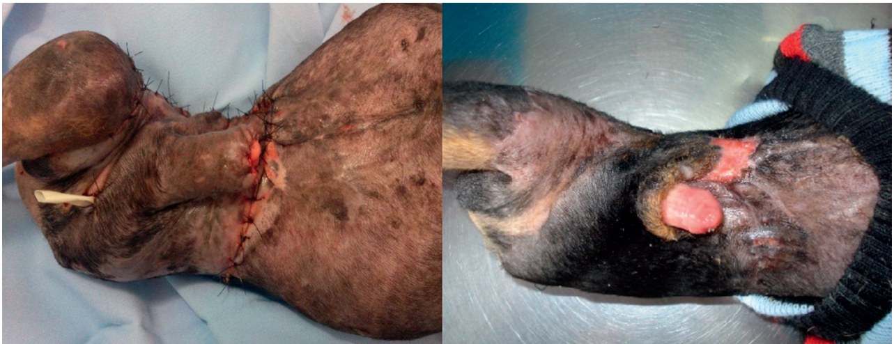
Figure 3. Immediate and 14 th day's post-preputial reconstruction appearance. Apariencia posquirúrgica inmediata y 14 días posterior al procedimiento y alta médica.

such as paraphimosis. The incidence of injury in the prepuce represent approximately 19% of male reproductive tract lesions. Among the traumatic causes, the most frequently reported are related to the sexual act itself, when owners attempts to separate the animals during coitus. Car accidents and firearms injuries are also frequently observed (Ndiritu 1979). The dog in this report was hit by a car, justifying the wound type and extent presented. Avulsion injuries occur when skin displacement is observed, with or without deep fascia and blood supply injury, depending on intensity of trauma and are often caused by motor vehicle tires (Pavletic 2003).